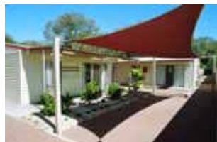
Amblin Caravan Park